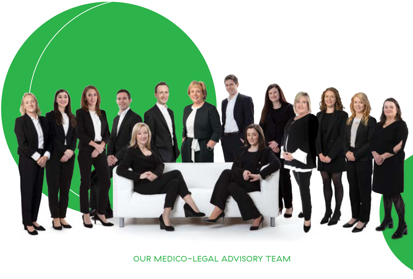
OUR MEDICO-LEGAL ADVISORY TEAM